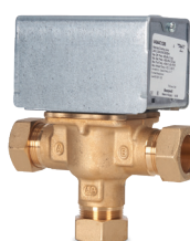
Three-Way Diverter Valve Kit Part Number: 6.5500048