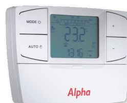
Comfort 2-Channel Control Part Number: 3.022142