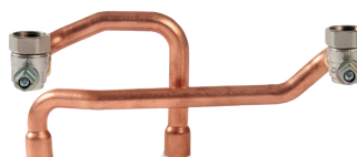
Pipe Crossover Kit Part Number: 3.032945