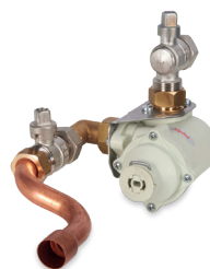
Cyclone Filter Part Number: 3.024172