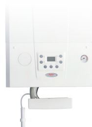
Condensate Pump Part Number: 3.026374