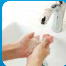
Prevents hard scale forming on taps

Softwater is water that contains very little natural minerals; this 'pure' water is actually aggressive to metals and causes corrosion. Consequently the tap water turns brown. Leaks and burst pipes may be the result.