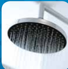
Shower heads & screens are easily cleaned