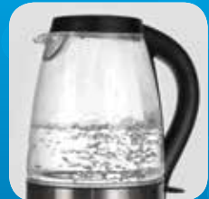
No need for harsh chemical descaling