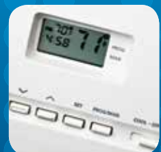
Maintains your boiler's energy efficiency